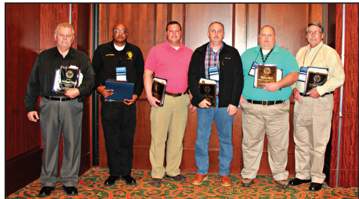
2015 Winter Conference 80 Hour Awardees