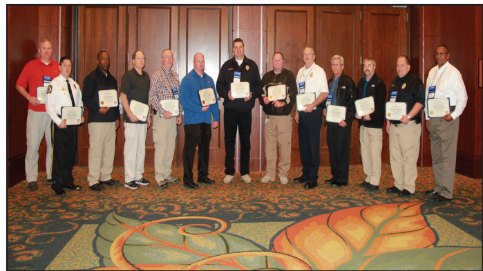
2015 Winter Conference 40 Hour Awardees