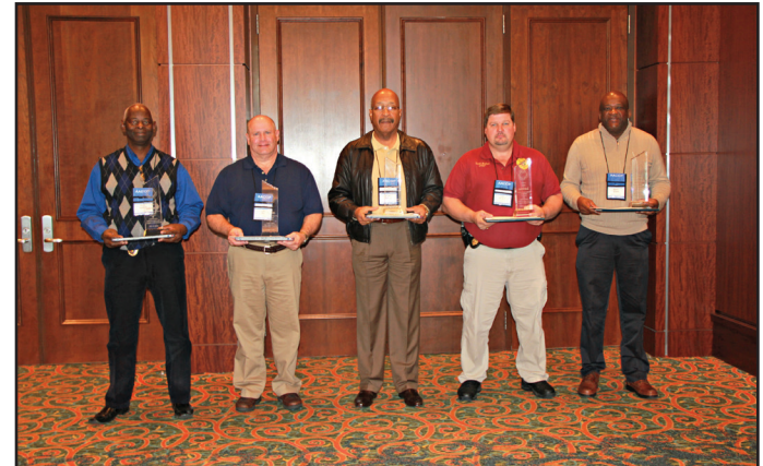
2015 Winter Conference 160 Hour Awardees