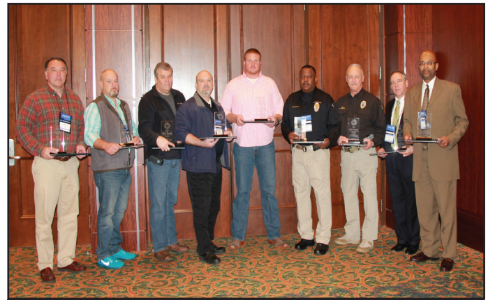
2015 Winter Conference 160 Hour Awardees