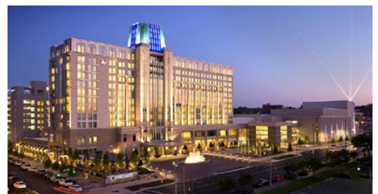
Renaissance Hotel and Convention Center 201 Tallapoosa Street | Montgomery, AL 36104 Reservations 334-481-5000