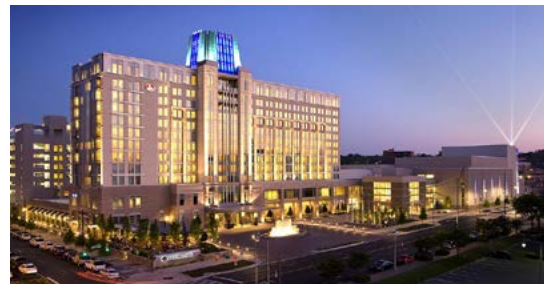
Renaissance Hotel and Convention Center 201 Tallapoosa Street | Montgomery, AL 36104 Reservations 334-481-5000