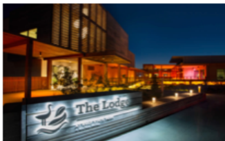
The Lodge at Gulf State Park 21196 East Beach Blvd. Gulf Shores, Alabama 36542 866-238-4218 251.540.4000