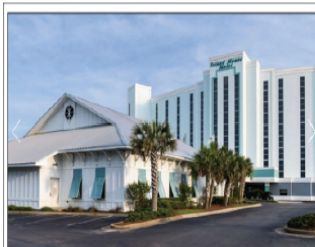
Island House Hotel Orange Beach a DoubleTree by Hilton 26650 Perdido Beach Blvd. Orange Beach, AL 36561 (251) 981-6100

Cancellations must be made 48 hours prior to arrival date.