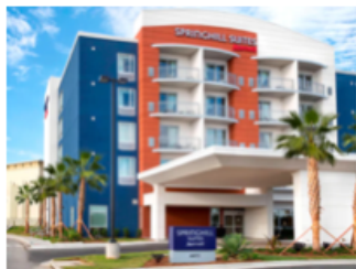
Spring Hill Suites 4673 Wharf Pkwy West Orange Beach, AL 36561 (251) 943-6600