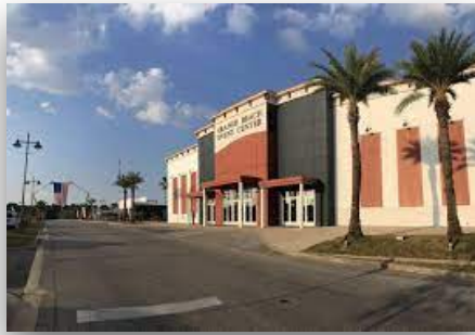
Orange Beach Event Center 4671 Wharf Parkway Orange Beach, AL 36561

Please remember that the Summer Venue is MUCH smaller than the Winter Conference. As a result, there is LIMITED SPACE available for exhibitors. Only thirty (30) spaces are available this Summer and will be released on a first PAID, first served basis. All spaces are 8', no exceptions.