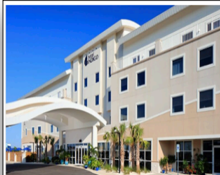
Hotel Indigo Orange Beach - Gulf Shores, an IHG Hotel 22843 Perdido Beach Blvd Orange Beach, AL 36561 (251) 981-1737

Cancellations must be made 48 hours prior to arrival date.