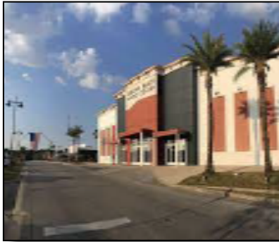
Orange Beach Event Center 4671 Wharf Parkway Orange Beach, AL 36561

Please remember that the Summer Venue is MUCH smaller than the Winter Conference. As a result, there is LIMITED SPACE available for exhibitors. Only thirty (50) spaces are available this Summer and will be released on a First PAID, First served basis. Booth space will be reserved on a First come, First served basis. Your space will NOT be confirmed until payment has been received. Exhibitors must be registered prior to the AACOP Conference in order to be guaranteed a booth space. Upon receipt of your payment, you will receive PAID invoice for confirmation.