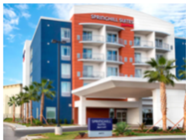
Spring Hill Suites 4673 Wharf Pkwy West Orange Beach, AL 36561 (251) 943-6600