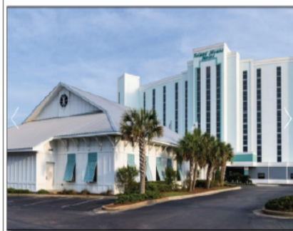
Island House Hotel Orange Beach a DoubleTree by Hilton 26650 Perdido Beach Blvd. Orange Beach, AL 36561 (251) 981-6100